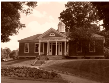
The Middlebury Historical Society building, just east of the Green in Middlebury,